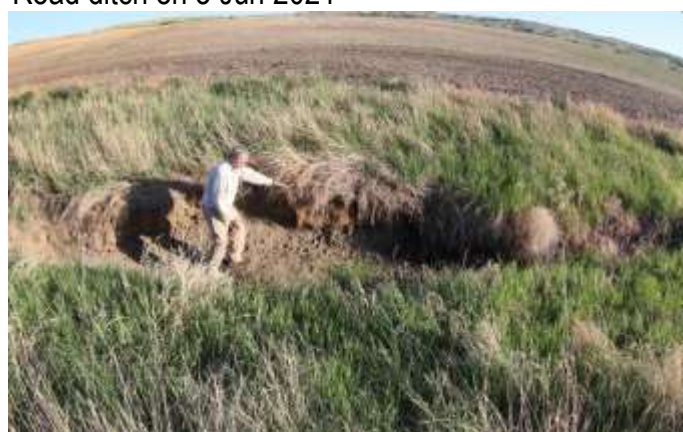
Road ditch on 3 Jun 2021