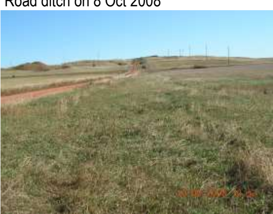
Road ditch on 8 Oct 2008