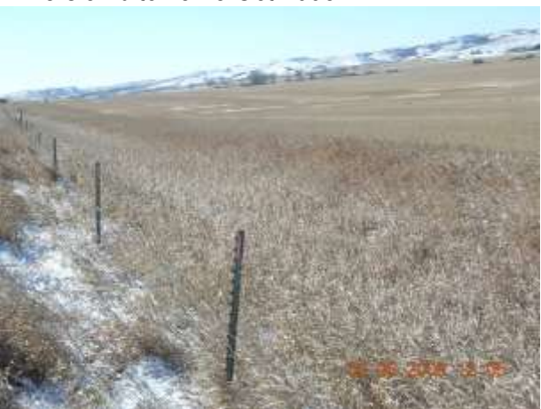
Diversion ditch on 8 Oct 2008